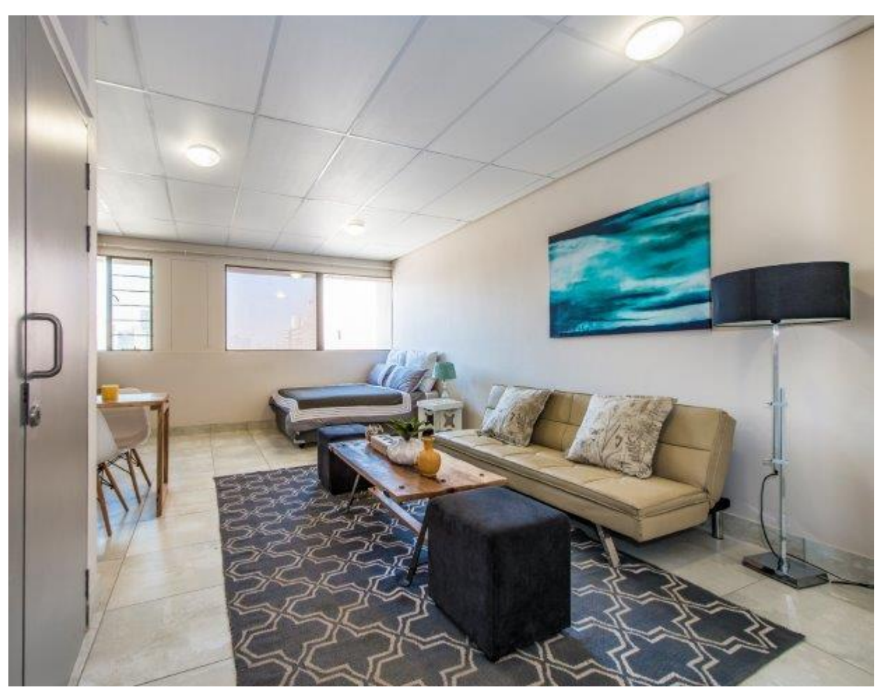
Paragon Architects converted Shell House in Johannesburg into housing

Indeed, the group has been converting office stock into residential projects for the past seven years. "We have completed a few thousand units in Johannesburg in that particular market. Linked to that are student housing projects, which are related but have their own risk and funding structures." This has been a large part of Paragon's built work, as it diversifies from being perceived as 'office building architects'. In Eswatini, Paragon has been involved at Malkerns Estate, a Greenfield middle-class housing project where unit sales have far outstripped the most bullish demand projection. Meanwhile, Paragon has also been working on low-rise and mid-rise apartment towers as far afield as Accra, Cape Town, Dakar, Johannesburg and Nairobi.