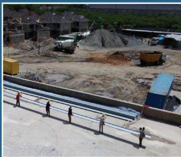
The first 22.3M long Newlok sheets in Kenya are site-profiled at Crystal Rivers, Athi river

These and more are the stuff that puts gloss on MRM and SAFAL Group's status as Africa's largest roofing company. VIVA MRM, VIVA SAFAL, VIVA NEWLOK!!!