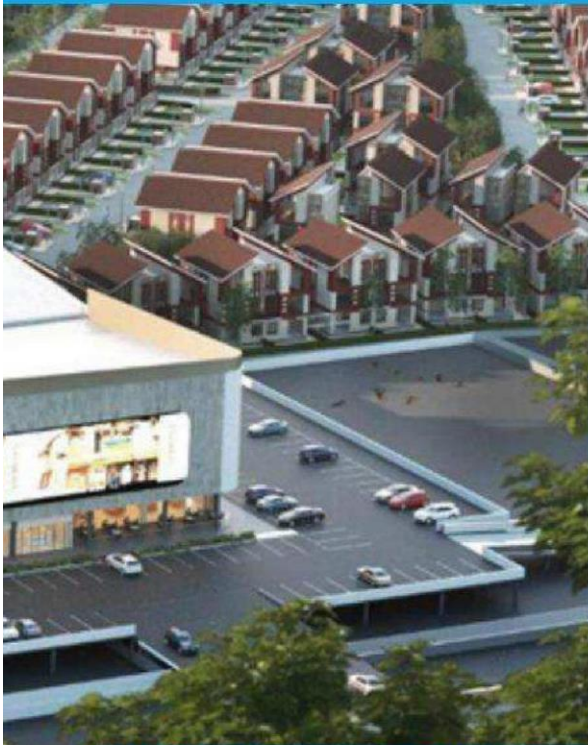
The architectural aerial impression of the Crystal Rivers Mall & Gated Community, off Mombasa-Nairobi highway, Athi river