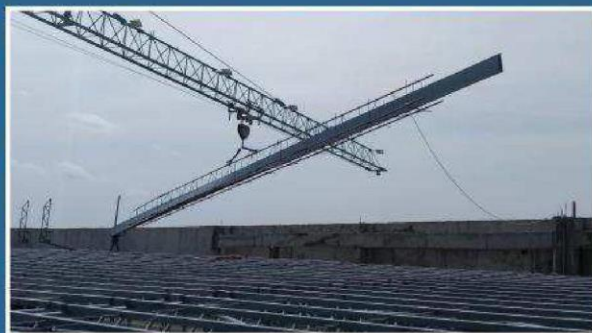
The over 28M length Newlok sheets for segment 2 arrive on the deck via crane for installation