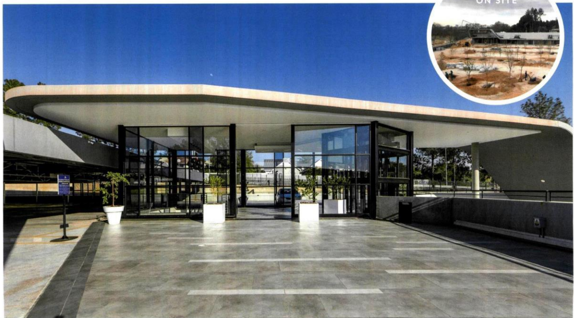
This material has been copied under a Not Selected licence and is not for resale or retransmission.

Overall, the unique and innovative design, coupled with the landscape, has resulted in a remarkable project, worthy of its many design and engineering accolades.